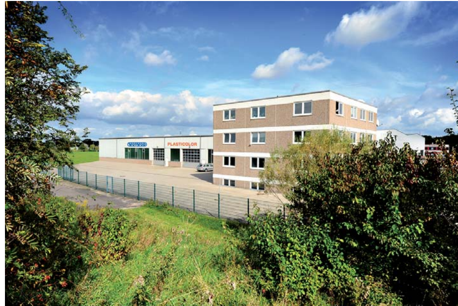
Woywod production site in Seefeld